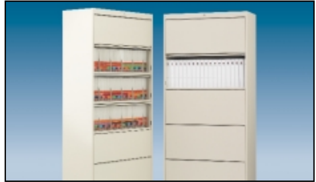
Datafile cabinets are available with 2 shelf heights for files and multimedia storage.

Records Management Consulting Services TAB and Datafile File Folders Colour Coding FileTracker™ Software TABQuik™ Labelling Software