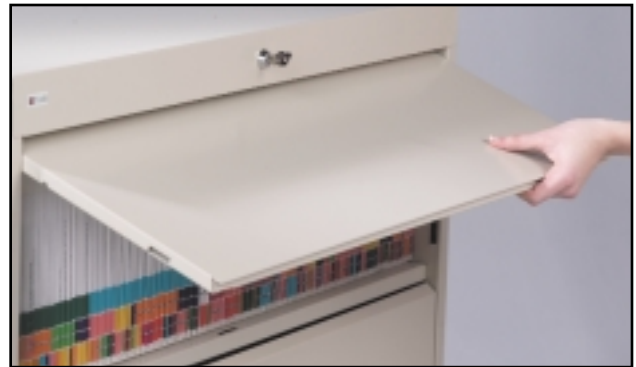
Long-lasting, scratch resistant paint finish is backed by TAB Canada's lifetime warranty.