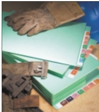
The most durable folder products available