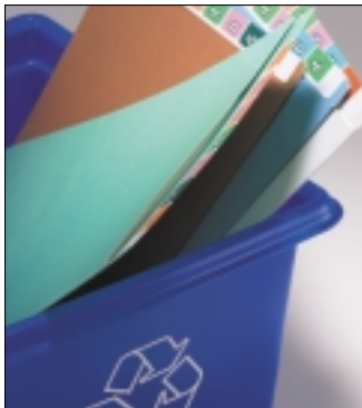
Environmentally friendly eternafilm coating

Complete family of coloured file products (file folders, pressed files, pressed classification files and expansion pockets) let you recognize files at a glance.