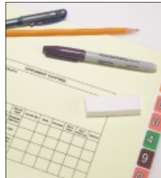
Write on, Erase and Reuse