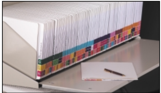
The retractable work shelf creates a workstation right within the system.