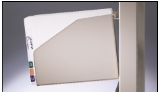
A 5° tilt to each box allows folders to be seen and grasped easily.

CONTACT ONE OF OUR REPRESENTATIVES TODAY.